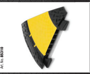
Art. No. 85310

WHEEL RAMP CHAIR AVAILABLE ON PAGE 24! (Art. No. 85305SET)