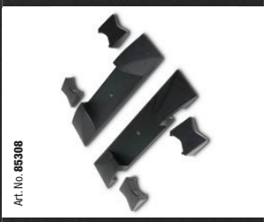
Art. No. 85308